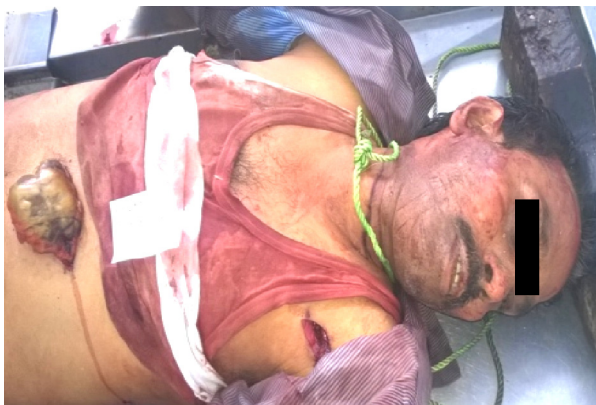
Fig 1: Injuries with ligature

After completion of autopsy it was opined that the cause of death in this case is Shock as a result of haemorrhage due to multiple stab wound in multiple organs and associated with ligature strangulation.