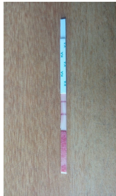
Fig 1 . Immunochromatographic antigen detection rK39 test positive

Epidemiological investigation : Epidemiological survey of his house and surroundings was done . The patient was residing with wife and two daughters in a make shift tent as his house was under construction. The surroundings were damp and had a lot of rank vegetation. Piles of firewood and construction of the house in progress all were favourable for breeding of sandflies. Entomological survey was done at dusk and flies collected (both from indoors and outdoors) from the site were identified as Phlebotomus argentepes .